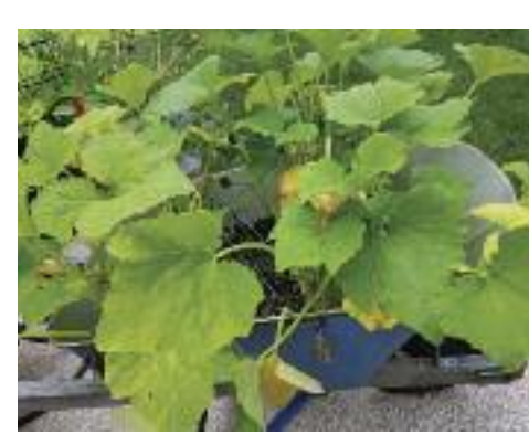
Squash growning in wheelbarrow