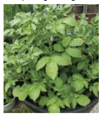
White potato plants