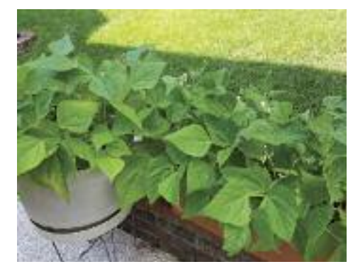
String bean flowers will become beans